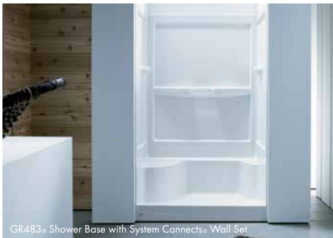
GR483® Shower Base with System Connects® Wall Set